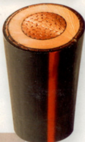
General Cable's thermosetting plastics form jackets and insulators like the one on this EPDM-insulated 25-kV power cable.