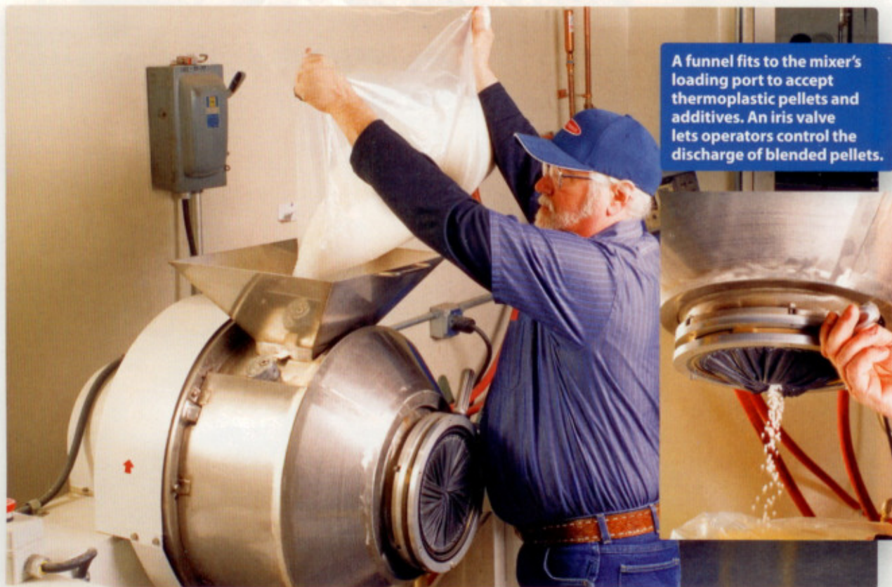
A funnel fits to the mixer's loading port to accept thermoplastic pellets and additives. An iris valve lets operators control the discharge of blended pellets.

may also add antioxidants to extend material lifetime and improve electrical properties.